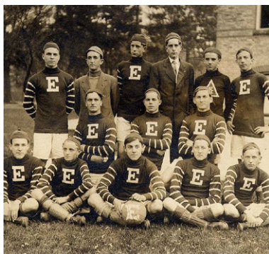
1910 The Elmhurst faculty deemed American football too dangerous, so the College fielded two soccer teams instead.