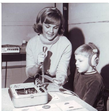
1967 The Speech Clinic gave students the opportunity to test their skills while providing therapy.