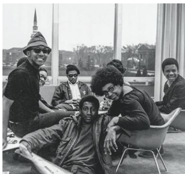
1969 The College's first Black Arts Festival, sponsored by the Concerned Black Students, featured a jazz quintet, a string ensemble, discussions and a fashion show.